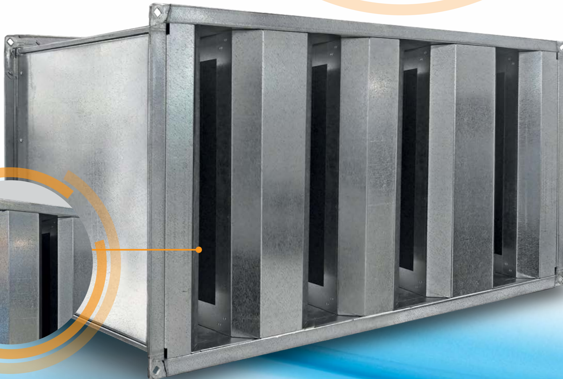
AirLay splitter section

These combined innovations help to reduce pressure drop which can often result in smaller and lighter attenuators able to be selected.